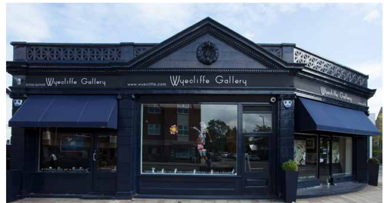
The Studio at Wyeclyffe has become Weybridge's premier gallery space, thanks to its cutting-edge lighting system and Control4 automation.