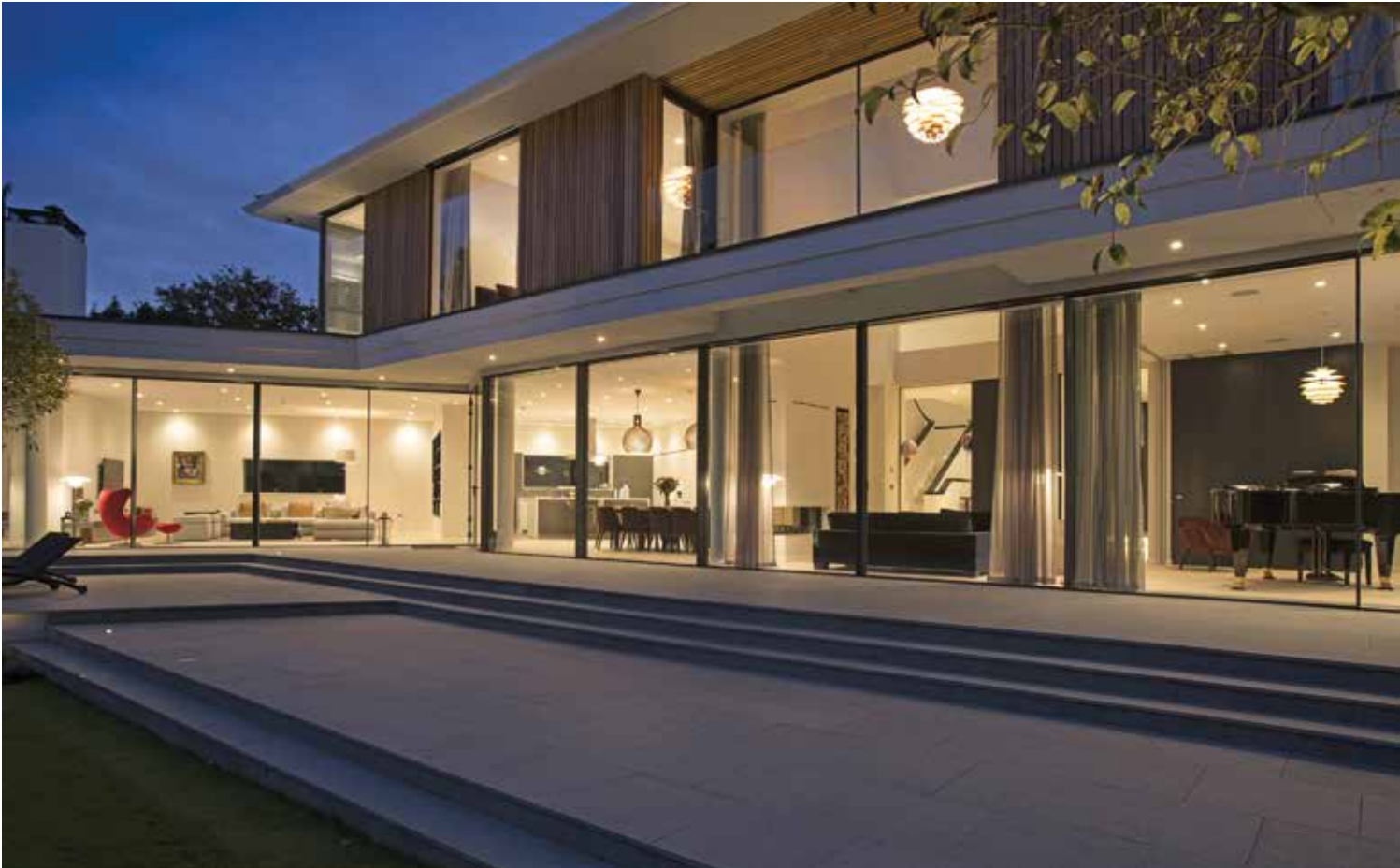
Client | Aspire/ Private Client